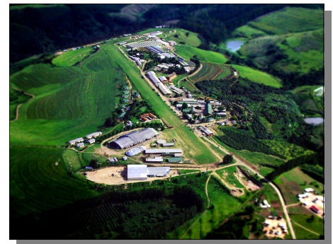
KwaSizabantu from the air

KwaSizabantu (KSB) is located among the Zulu nation of Natal, South Africa. The mission has its own airstrip (equipped for night landings), an auditorium seating 10,000 people, a hospital, high