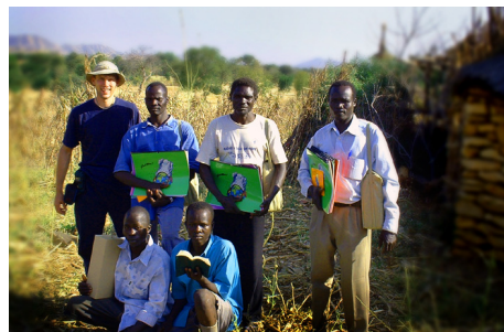
Tim Keller and newly equipped evangelists

plete with colorful flipcharts and 9-hours of Bible teaching tapes, from Genesis to the book of Acts, in various languages. The kit includes the Gospel Recordings Messenger, a rugged tape recorder that can operate on solar power or is hand cranked, thus eliminating the need for batteries (and there is no electricity!).