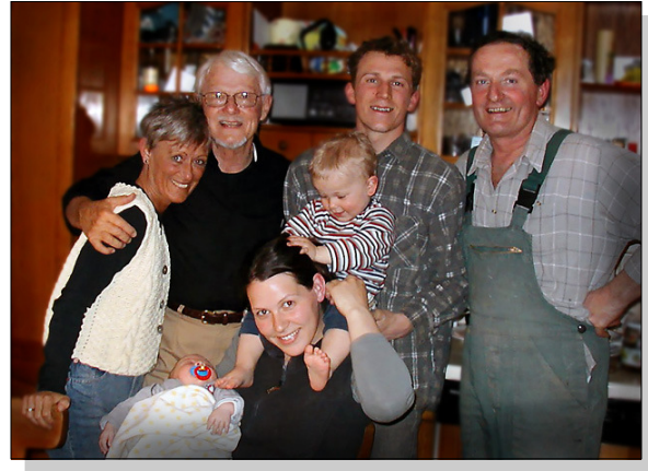
Four generations at the farm