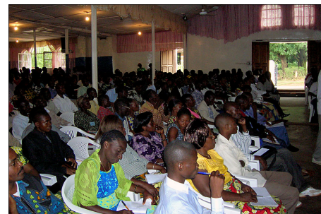
Seminar delegates take notes.