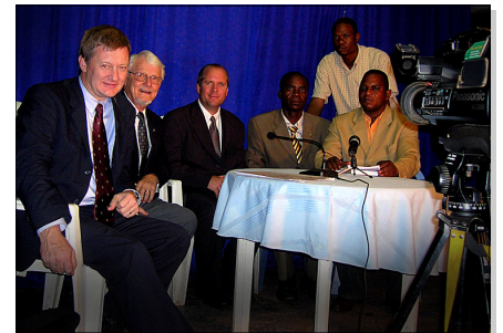
The BWS team on TV Sunday night.

In Touch Mission International, PO Box 7575, Tempe, AZ 85281 - (480) 968-4100