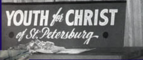
YOUTH for CHRIST of St. Petersburg