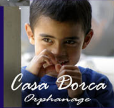
Casa Dorca Orphanage