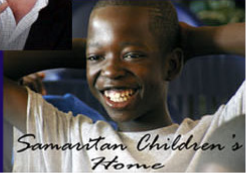
Samaritan Children's Home