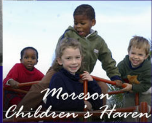
Moreson Children's Haven