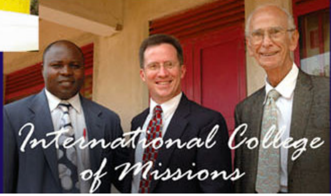
International College of Missions