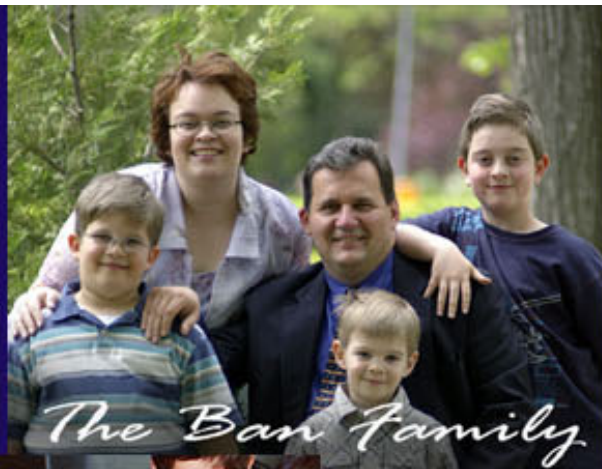
The Ban Family