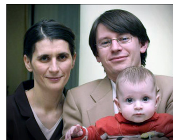
A young Romanian family from the first YCF group.