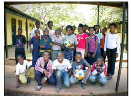
Some ECA students.