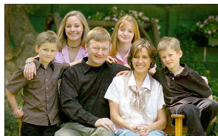
The Hammond Family.