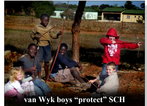
van Wyk boys "protect" SCH