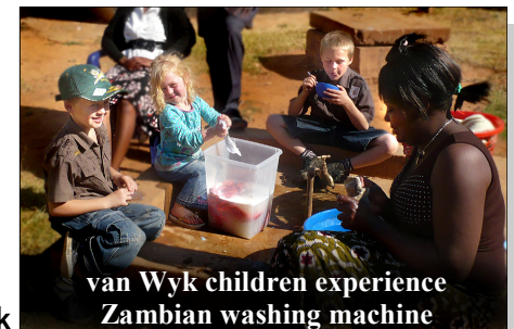
van Wyk children experience Zambian washing machine