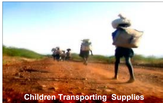
Children Transporting Supplies