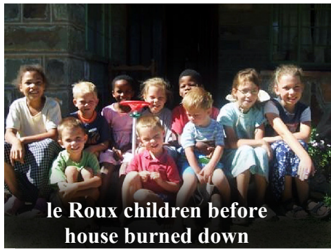
le Roux children before house burned down

Decisions made now will impact the future. Elmane wisely noted, "Are we just building for ourselves? Or are we building for generations to come who will continue the work?"