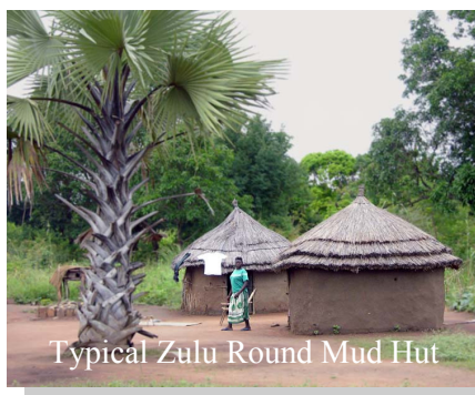
Typical Zulu Round Mud Hut