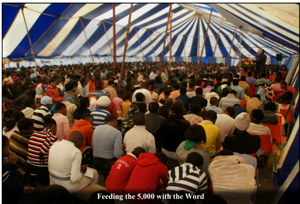
Feeding the 5,000 with the Word