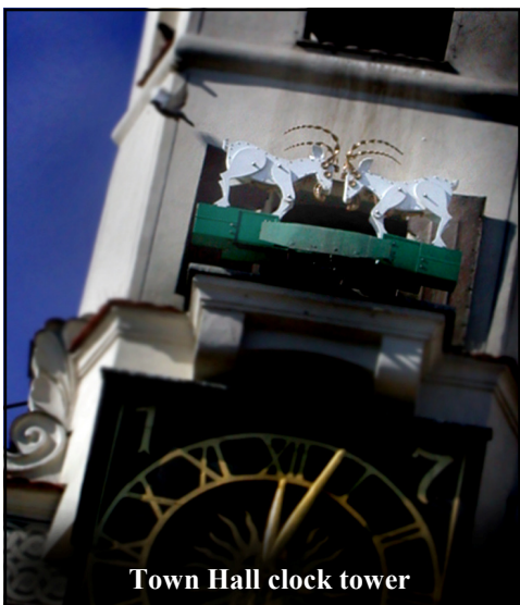
Town Hall clock tower

On the turret of the Town Hall clock tower, these famous cast-iron wonders purposely and methodically butt heads against each other twelve times in a mechanical ballet of violence. Though both goats return to their respective places within the clock tower, the line of demarcation has been publicly reaffirmed. Morning no longer dominates. Evening now rules.