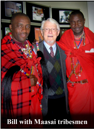
Bill with Maasai tribesmen

It's ironic: China is indignant over worldwide demonstrations prior to the Olympic Games, but they send military supplies to Zimbabwe to perpetuate the pathetic reign of a ruthless communist dictator, Bobby Mugabe. Leading up to the Summer Olympics, many groups will try to exercise some kind of leverage for their cause if they perceive Beijing is vulnerable to worldwide pressure. Meanwhile China's economy is booming and its financial power is growing overseas, especially in Africa, while it spends more and more money on its military.