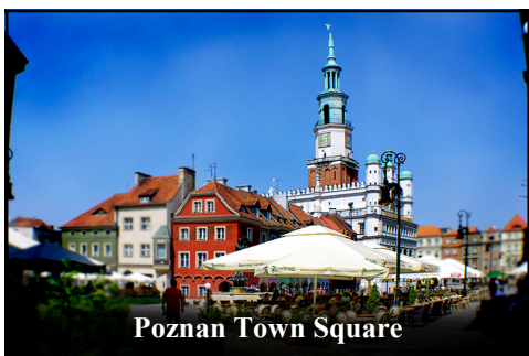
Poznan Town Square

This cheerful, relaxed ambience made the bindle stiff stooping over the table seem outlandish. His flea-bitten outfit was tattered, caked with splotches of mud and blood. The stench of uncleanness overpowered the