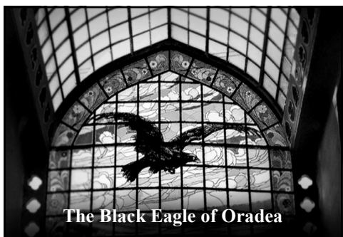
The Black Eagle of Oradea

Oradea, throughout its history, has been rich in symbolism – though the