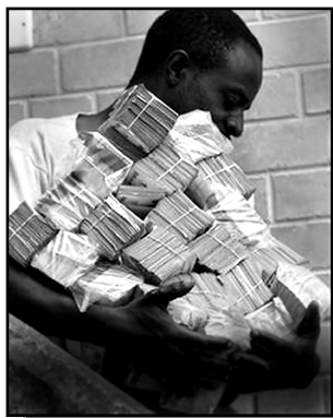
Not enough Zim dollars to buy a loaf of bread

Suddenly after days of waiting we received a one line email message from our Partners saying, “Here is the family we met.” Pictures were sent of the family, a broken-down church building where they gather for worship, and the funds they received from a gracious Christian family in the US.