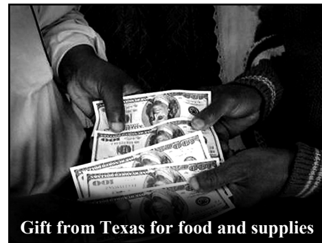
Gift from Texas for food and supplies

A liberation “savior” to his people no longer, Mugabe is clearly one of the many “false christs” that our Lord prophesied