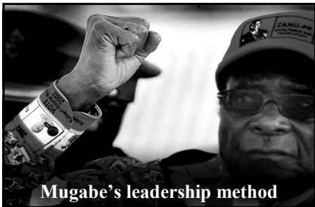
Mugabe’s leadership method

A little over a month ago, a mercy mission was conducted by one of our ITMI Project Partners in Africa in order to bring food and money to a starving family in Zimbabwe. Once considered the “bread basket” of Africa because of its rich mineral deposits and fertile farming soil, Zimbabwe’s land lies fallow and unproductive under the terrorist regime of President Robert Mugabe.