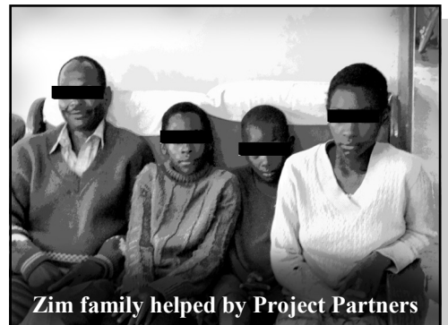
Zim family helped by Project Partners

For this 3 rd mission a brief moment of opportunity opened up in June, but we were quickly notified that the situation had become extremely dangerous – with