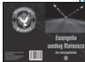
Polish Gospel of Matthew Translation