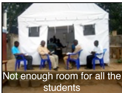
Not enough room for all the students